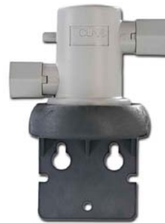
VH3-BSPT head VH3-JG head