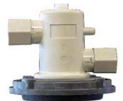
VH3-BSPT / VH3-JG no bracket head